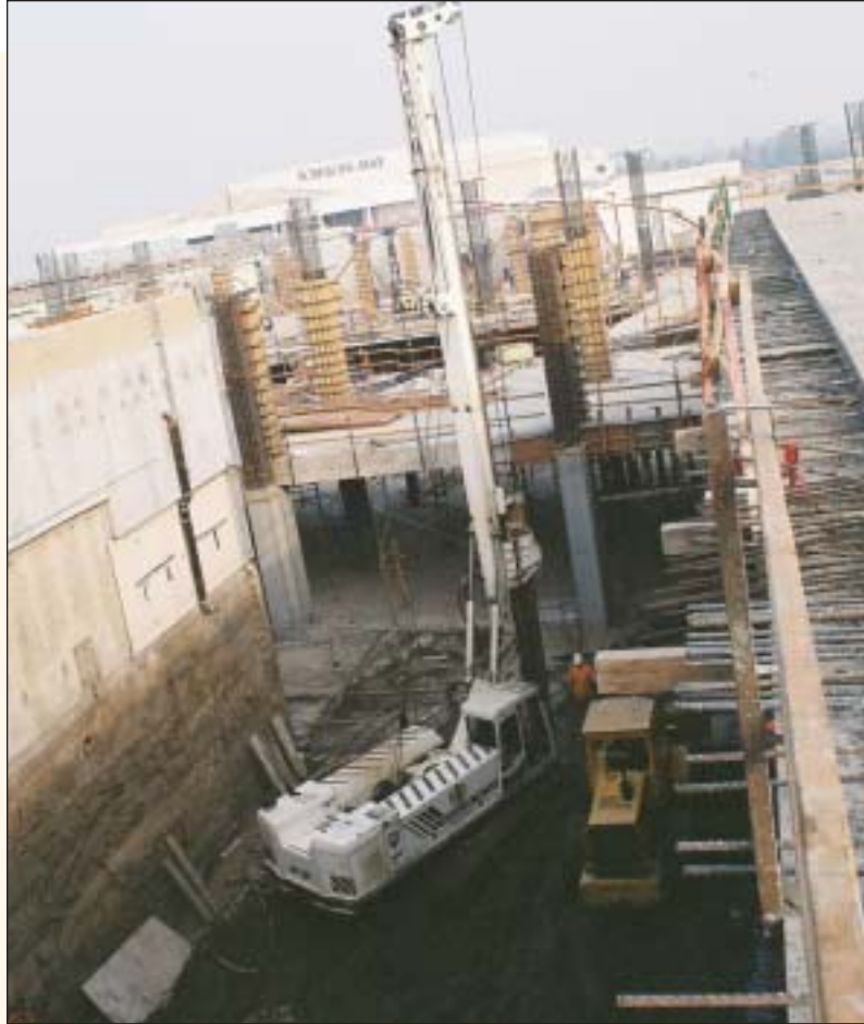
Into this confined area, Magco stuffed our Mait 130 drill rig, Cat 930 loader 75' long tremie and 60 ton Grove Rough Terrain crane.

Due to our aggressive performance, Westfield awarded Magco the second foundation area immediately adjacent to where we were currently working. At that time, Magco was contracted to install a total of 1,236 drilled piles. To date, this was the largest drilled pile project undertaken by Magco Drilling Inc. The project amount at time of award totaled $6.9 million dollars.