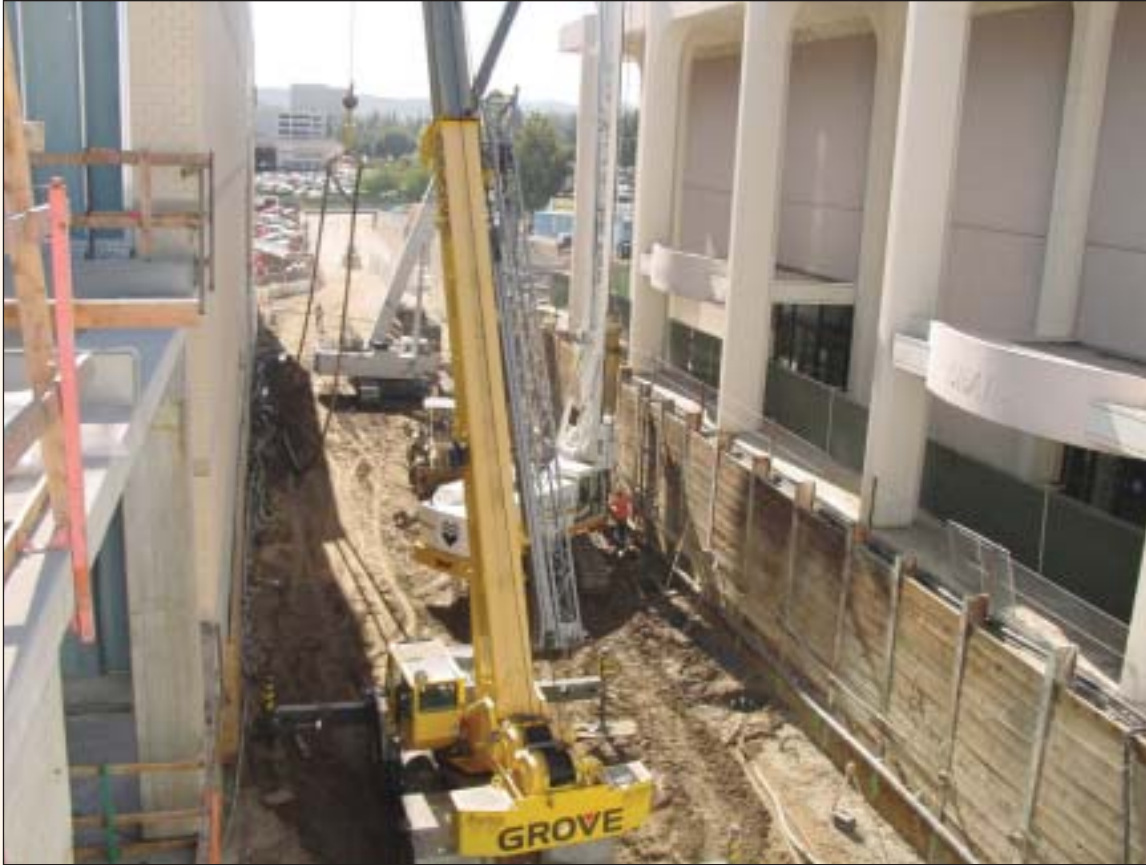
The Plaza Level consisted of 95 drilled shafts, 36" diameter x 78 foot deep located in a narrow dead end notch 35' feet wide by 150' foot long.