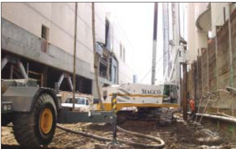
Installing 1,331 Drilled shaft foundations at Westfield Shopping Town Parking Structure Canoga Park, Ca. Magco Drilling's largest drilled shaft project to date.