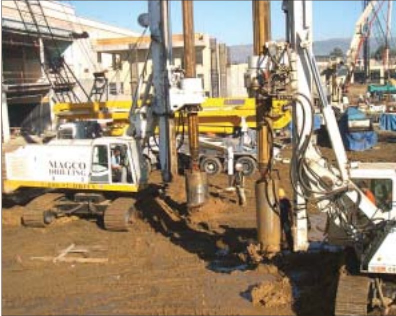
A typical day for Magco drilling at the Westfield Parking Structure.

Magco Drilling's equipment consisted of the following: a SoilMec* 312, a SoilMec* 930, a Mait* 180, and two Mait* 130 drill rigs. Also used were a 80-ton American crawler crane, a 70-ton Mantis crawler crane, a 60-ton Grove rough terrain crane and a 13-ton Mantis crawler crane. A couple of Morooka rubber-track dump trucks were used to tow our tools and vacuums through the