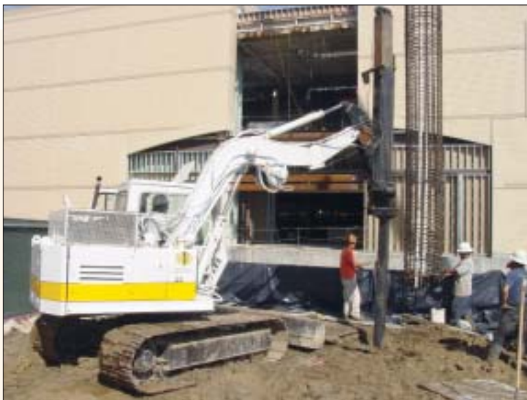
Magco Drilling's owner Mike Maggio designed and built the drill rig utilized at this location.

Taking into consideration, the daily coordination of concrete and rebar cage deliveries, holes to drill, fluids to transfer, handling and loading out wet drill spoils, cages to place, and concrete to pour, our field team performed with excellence each day of the project. Magco's team of employees on this project and all other proj-