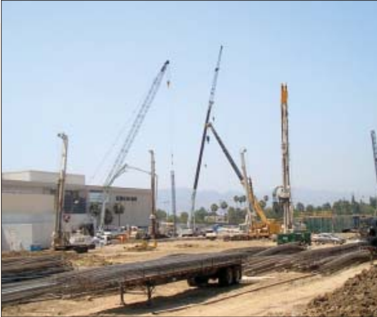
The daily coordination of maintaining production and scheduling material deliveries was challenging.