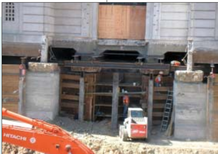
Existing columns were preloaded from 12-90k. Columns formed, poured & grout packed.