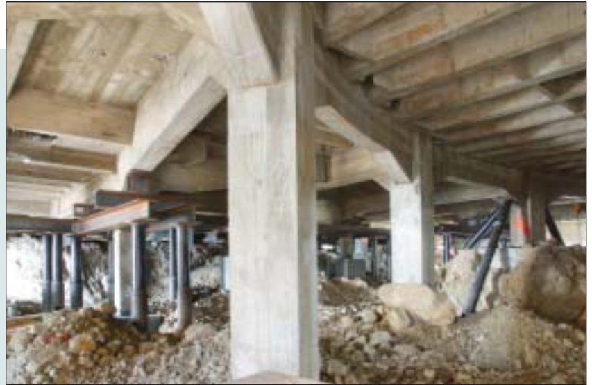
Limited overhead clearance, unique configuration of the existing ceiling beams and column loads proved to be a challenge.

building, Magco shored and under-pinned footings at the north entrance. This area was dubbed with the name "Worm Hole." The Worm Hole corridor and connecting stairway will allow access between two improved areas, stepping downward from the underside of the existing