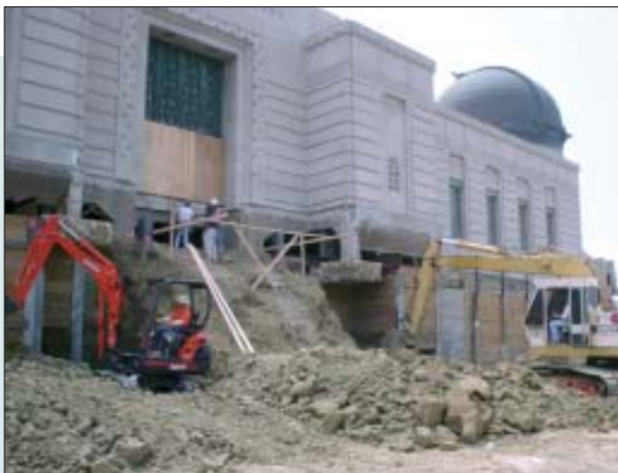
Excavating prior to placing underpinning columns. Piece of cake!

Because of the historically important visual signature of the site, it was decided early on that the proposed additions should not compromise the historic fabric of the building. For this reason the entire addition will be almost entirely below grade.