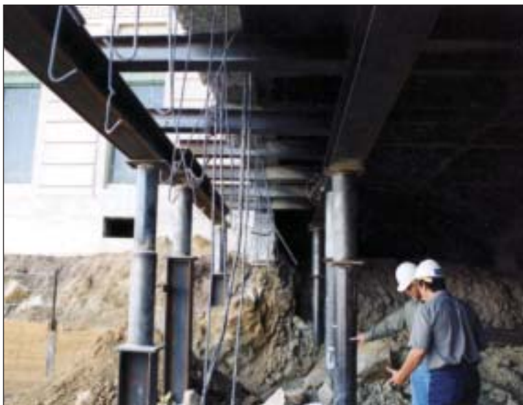
City inspector and engineer, "This costs how much?!"

During the mass excavation, a small landslide developed. The Owner and Amoroso directed Magco to provide additional shoring adjacent to the historical monument directly north of the building. Due to the extra efforts of Magco, Cefali & Associates, Amoroso and the cooperation from the City of Los Angeles, this emergency shoring was designed and implemented in a matter of 3-4