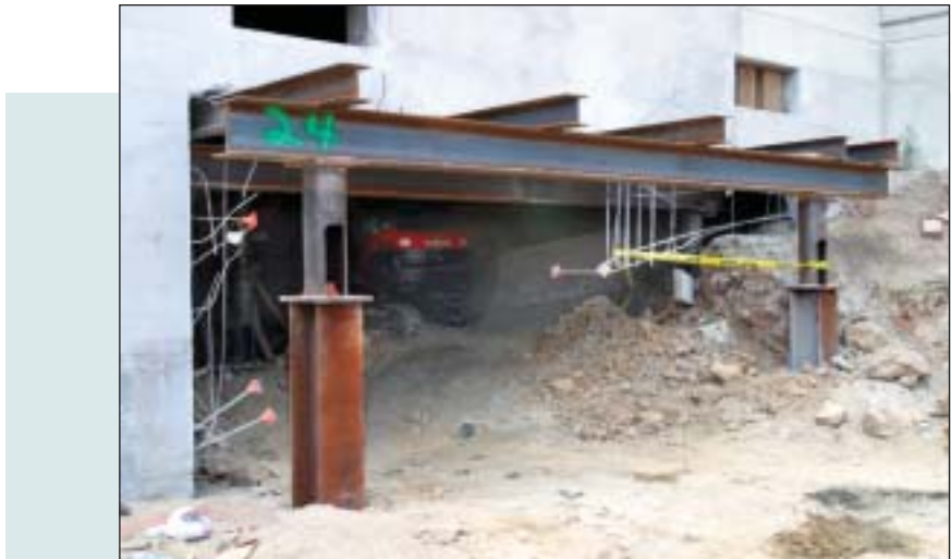
Access at the east and west ends of the Observatory building.

The existing building was a single story structure with a reinforced concrete foundation, first floor, pan joist system and exterior walls. The roof construction was structural steel and reinforced concrete slabs. Exterior walls were up to fourteen inches thick with concrete slabs for floor and roof. This type of construction made the building extremely heavy. Wall footing loads in some cases